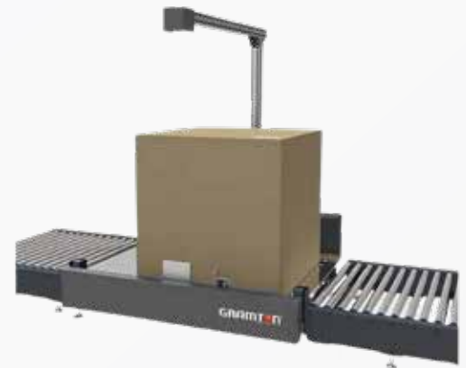
GDWS TR with ramp