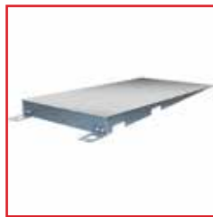
Platform with Ramp