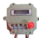
Flame Proof Indicator